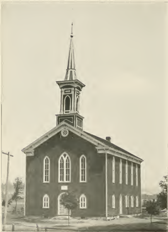
ZION'S (OLD RED) CHURCH

Original church built 1755, burned by the Indians 1756; next church completed 1770; rebuilt of stone, completed 1803; stone church razed and replaced with present building 1883